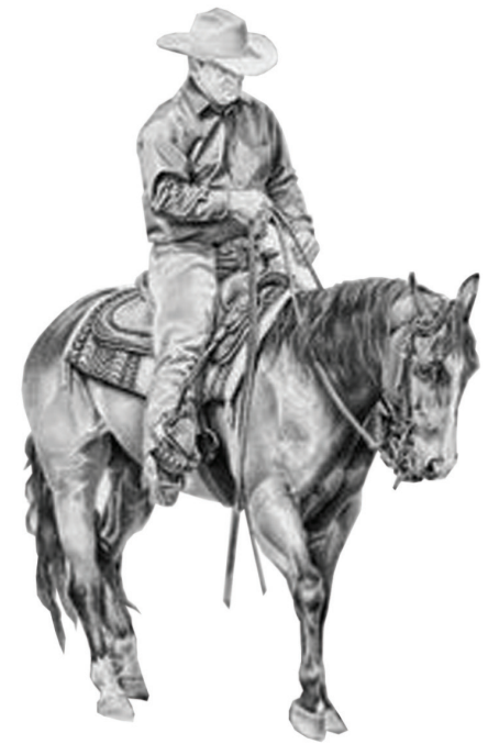
$$ - Payback Class

*PLEASE NOTE: All Schooling Breaks will be 5 minutes in duration.