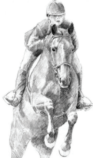
$$ - Payback Class

*PLEASE NOTE: All Schooling Breaks will be 5 minutes in duration.